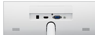
Built-in HDMI input makes the FM-27 easy to be paired with Full HD multimedia devices