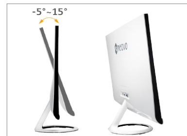
User-friendly designed stand allows to tilt from -5° ~ 15°