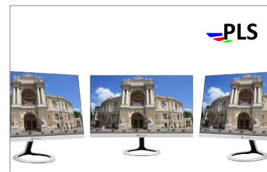
PLS panel provides superior clarity from all angles